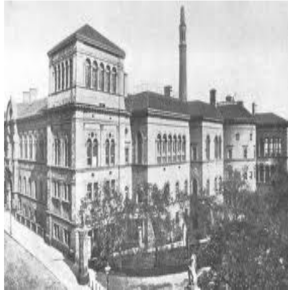
Old Edinburgh - EDINBURGH UNIVERSITY MEDICAL SCHOOL