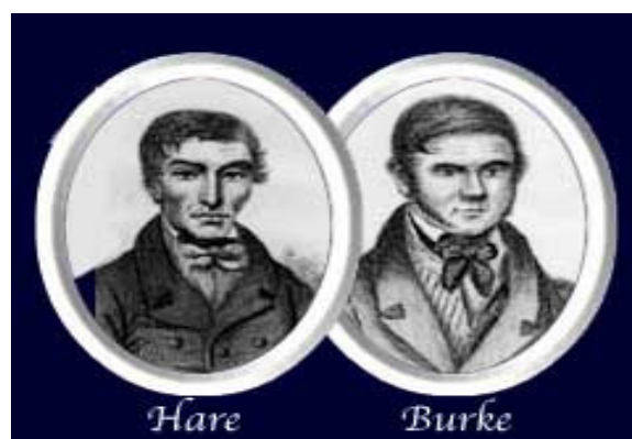
BURKE AND HARE